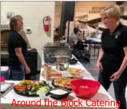
Around the Block Catering

Trivia Night was November 9 th . We had eight teams of competitors. Trivia Newton John was the winning team. It was a great night! The food was fantastic. The competition was fierce, but fun. We raised some money for the museum. Plus, we all learned something! We will do this again next November. Be on the lookout for next year's teammates!