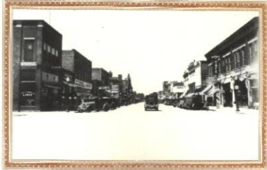
Published by The Dawson County Historical Society